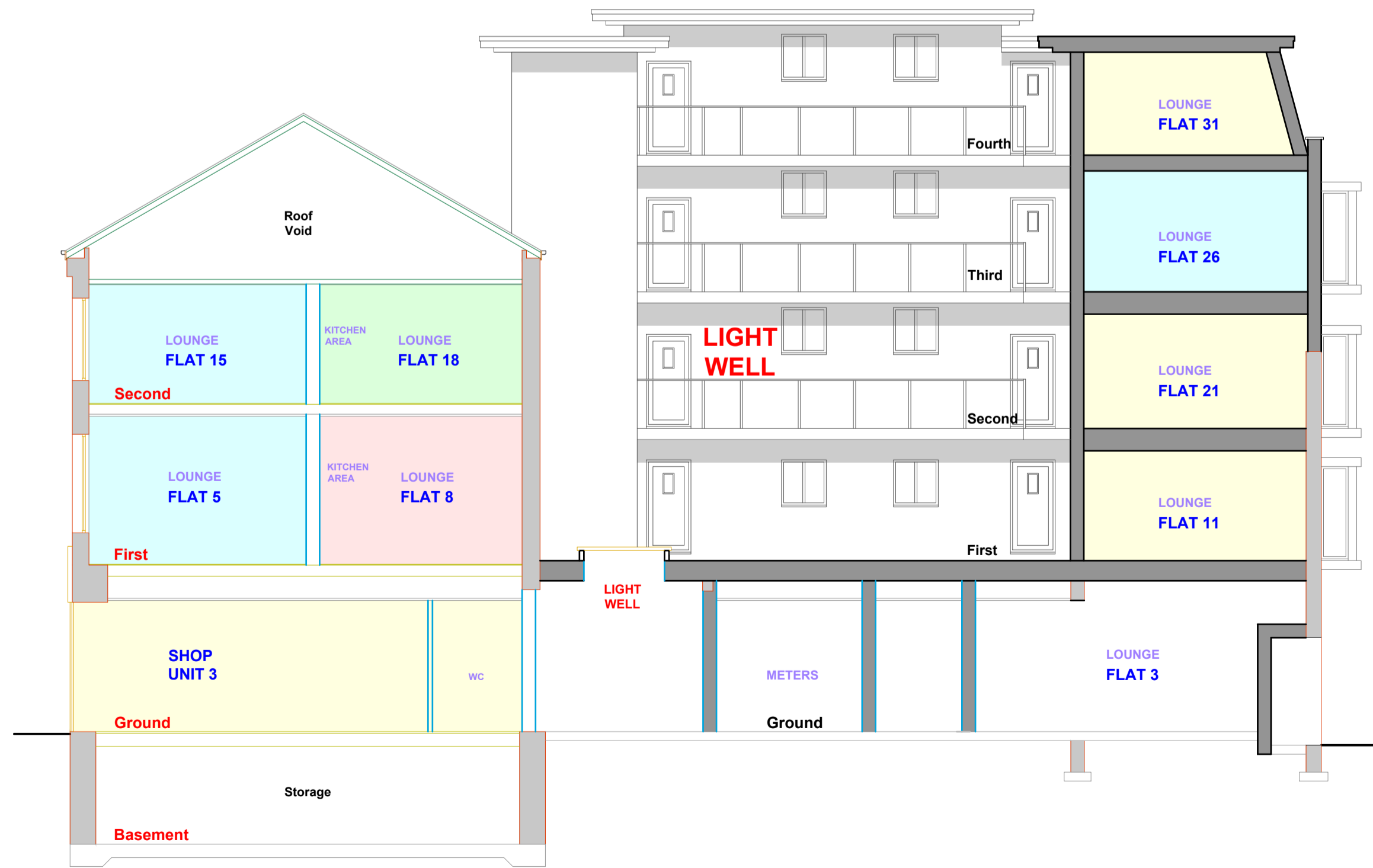
PROPOSED SECTION X - X

This drawing is provided as a document to gain either Planning Permission or Building Regulation approval purposes only. It is not a guarantee that Planning Permission will be granted. This drawing and all contents are the copyright of James Campbell Associates Ltd. No copies to be made from the drawing & details without the written authority of James Campbell Associates Ltd. The contract for the works is between the client and his / her contractor. Contractor to visit site, study the details provided within the drawing and be familiar with both the work to be carried out in accordance with the details provided. Any stated dimension must be checked prior to any form of construction. All works and materials to comply with all relevant British Standards and carry a genuine BBA certificate. The materials specified within this drawing are a guide for the contractor as they are recognised materials with genuine BBA certificates etc. Any contractor who decides to use any different materials than that noted on the drawing must inform James Campbell Associates Ltd. Any discrepancies discovered or items found that were not visible at the time of the initial survey should be reported to James Campbell Associates Ltd for consultation with our client.